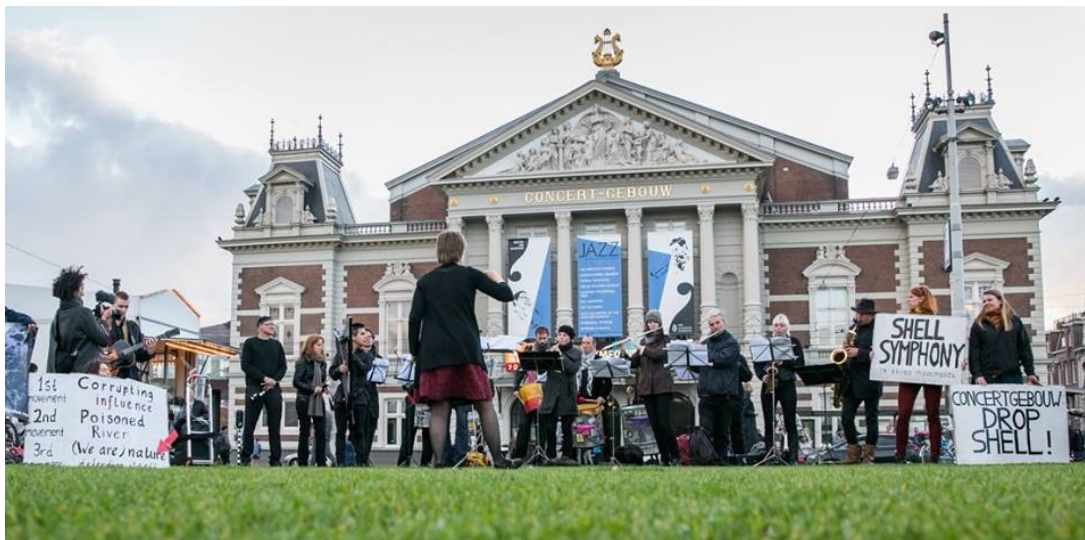
Music action (Oct 5th, 2017) 'Drop Shell sponsorship' Royal Concertgebouw, Amsterdam.

We can shift public support away from the fossil fuel industry by pressuring our public institutions to break the sponsorship ties they have with many fossil fuel companies.